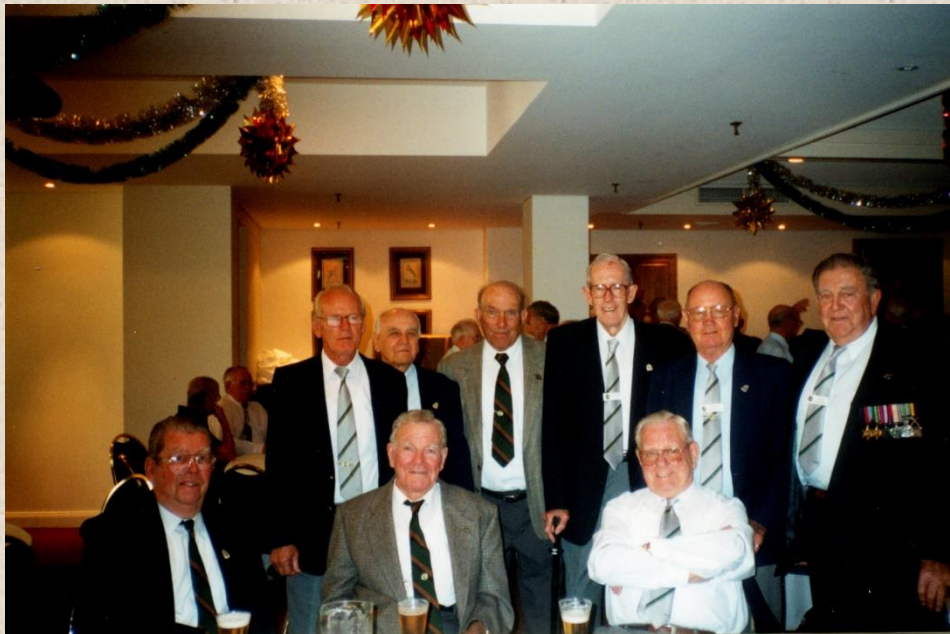
Figure1. Sanananda Day Reunion at NSW Leagues Club in the 1990's