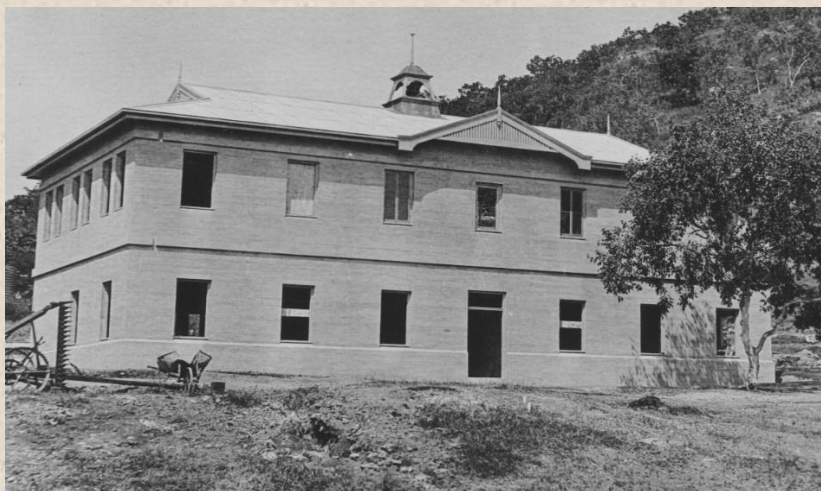
Photos: European Hospital Port Moresby under construction in 1932.